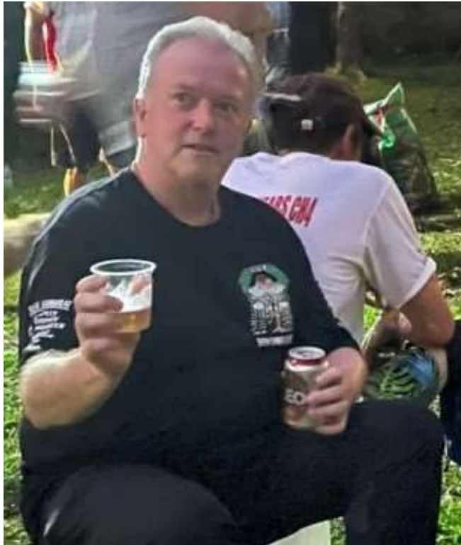
Male Wings: Belly Dancer