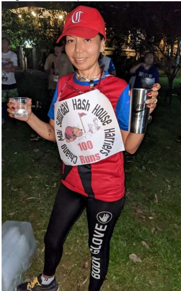
Congratulations Bushy Tail - 100 runs