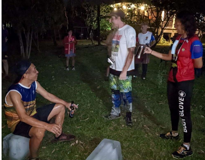
Suckit splash JC for his 29 baht stainless steel hash mug