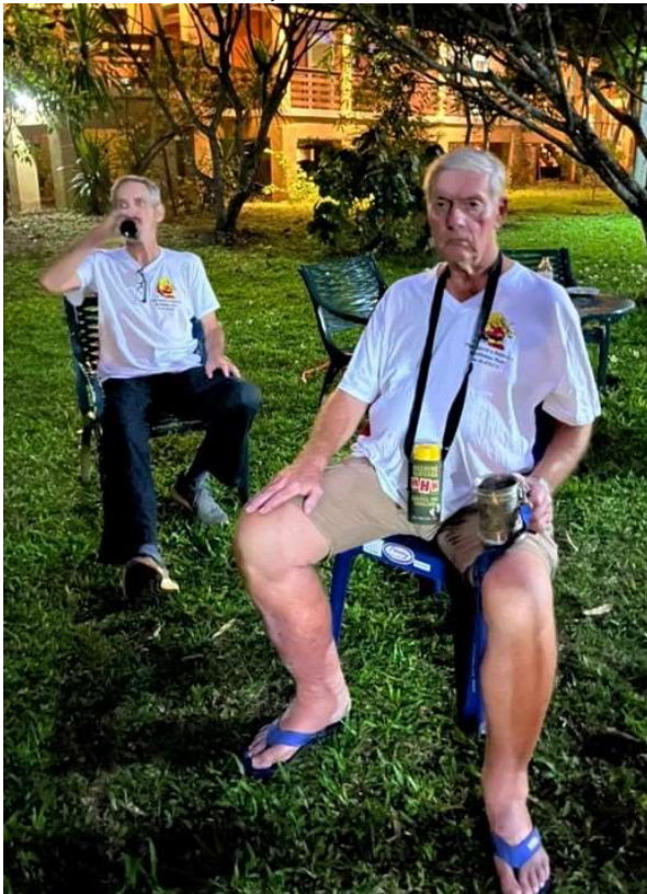
The Devil's Reject and Tip Toe maintain a safe distance from the mayhem