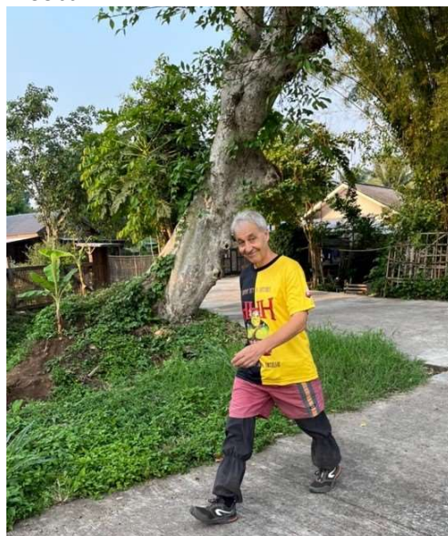
Piggy enjoying the stroll through Sups' moobahn.