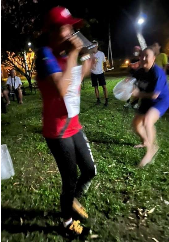
Soaking Bushy with ice cold water!