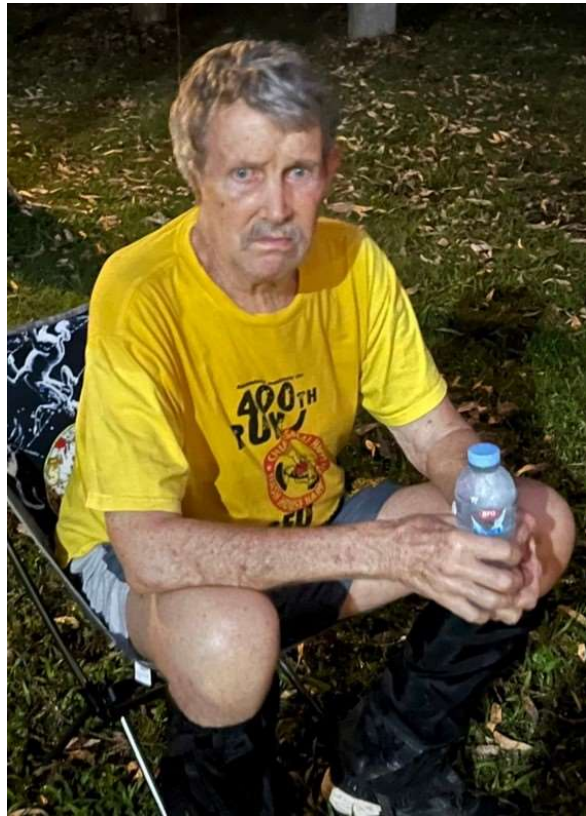
Square Rooter is concerned