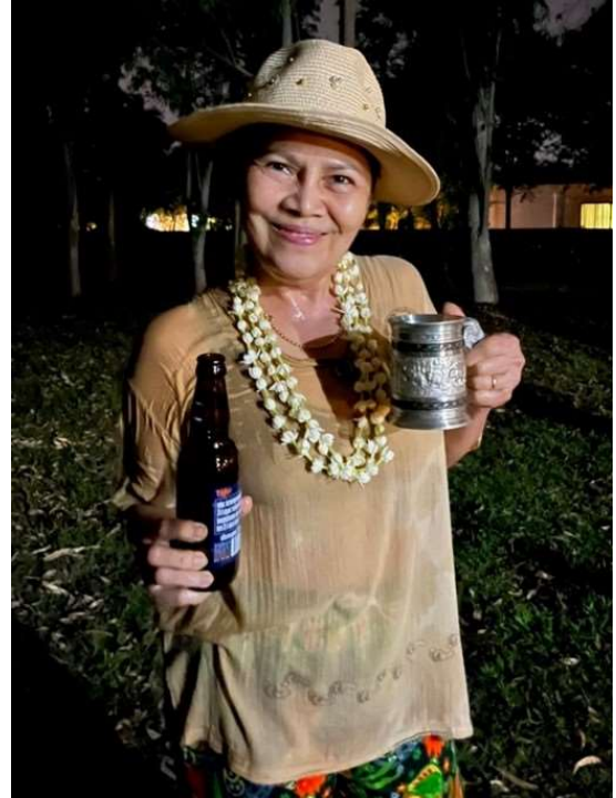
Superbitch having a great time