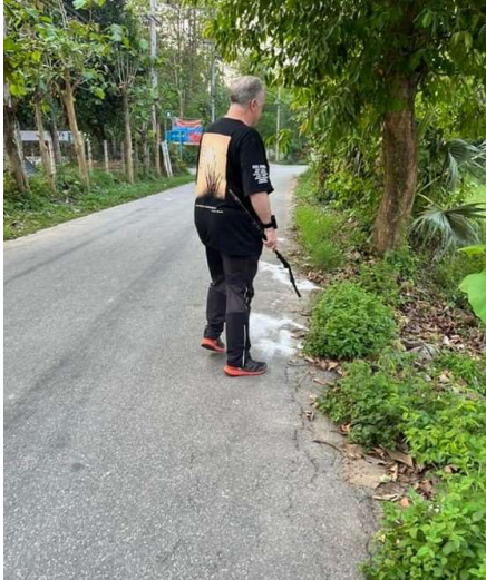
Belly Dancer inspecting the Wimp-Rambo split