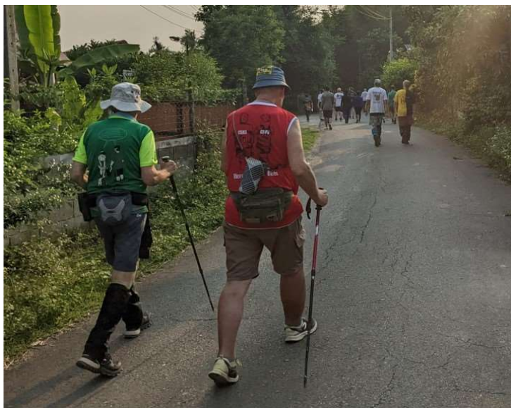
Square Rooter and Tip Toe, the rear-walking bastards.