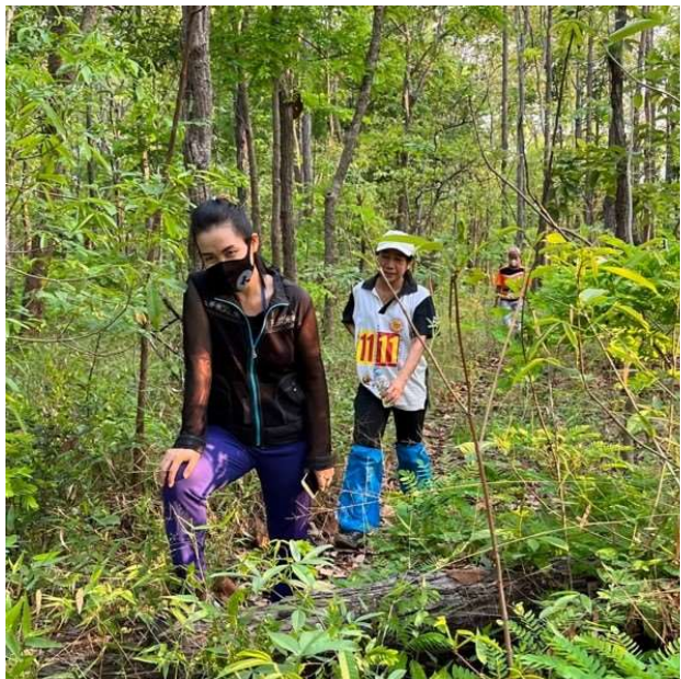
Sticky Mango thinks "This is the wimp run? Wimp runs don't have hills like this!"