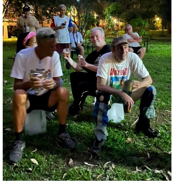
Welcome back long-time returnees: Doesn't Get It, Belly Dancer, Suckit and Shagless