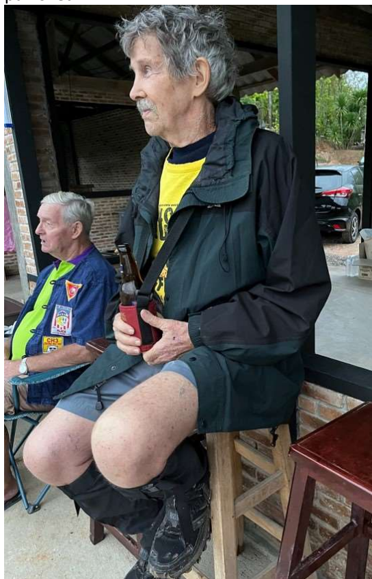
Tip Toe and Square Rooter enjoy seeing the hares punished