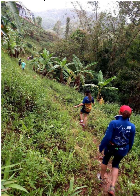
Bangkok and Superbitch on Trail. You can see the A-bucket at the top-left