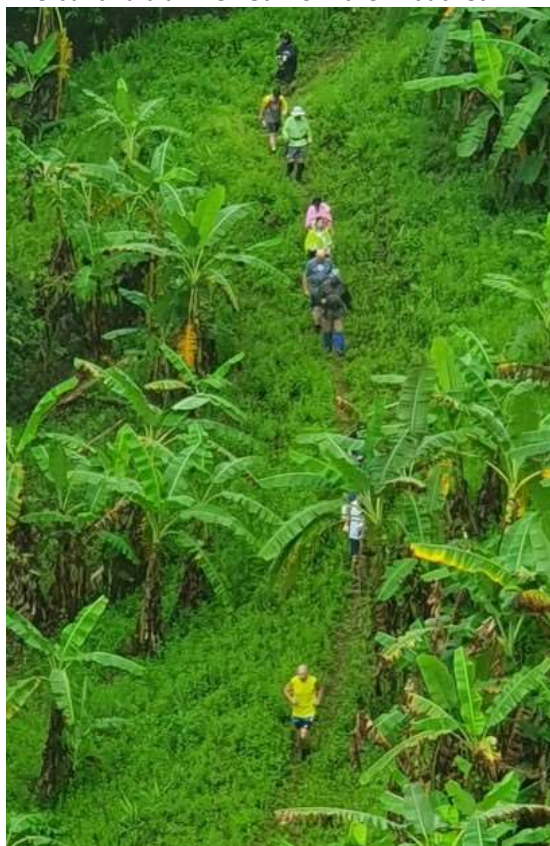
The banana trail viewed from the A-bucket