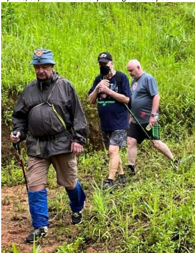
Tip Toe, Superman and Sticky making their way down