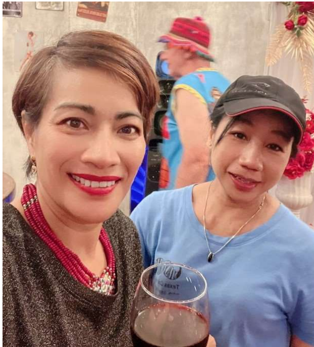
Snail Trail and Always on Top