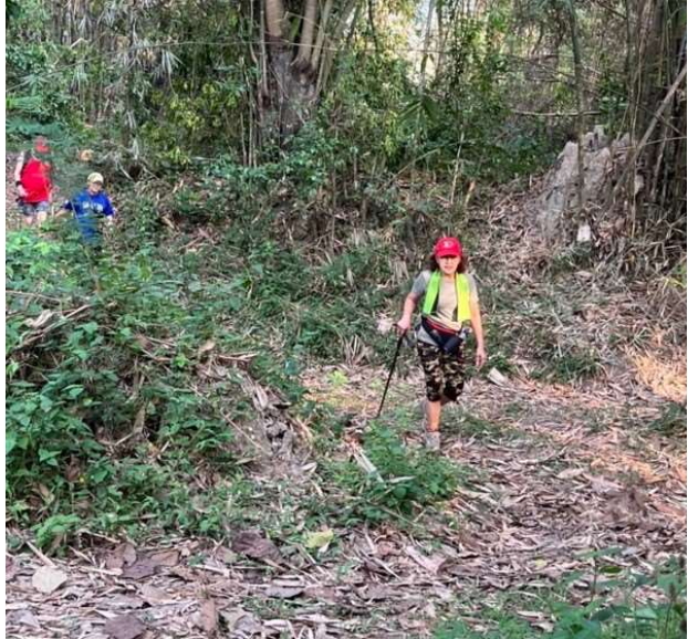
Superbitch leads the Wimps