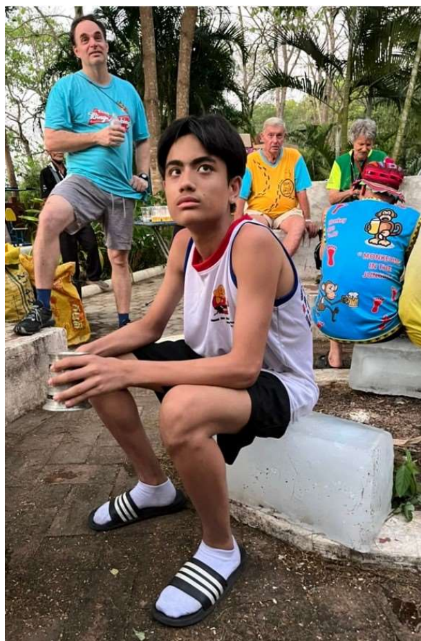
Co-hare Sinbin on the ice