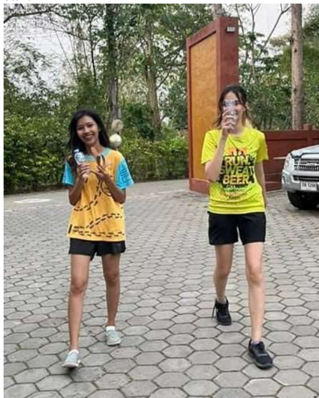
CAT and Chatterbox stroll in 90 minutes after the start