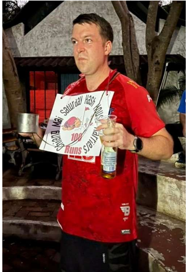
Deep Throat reached the 100 run milestone, and wasn't happy about not getting his proper mug