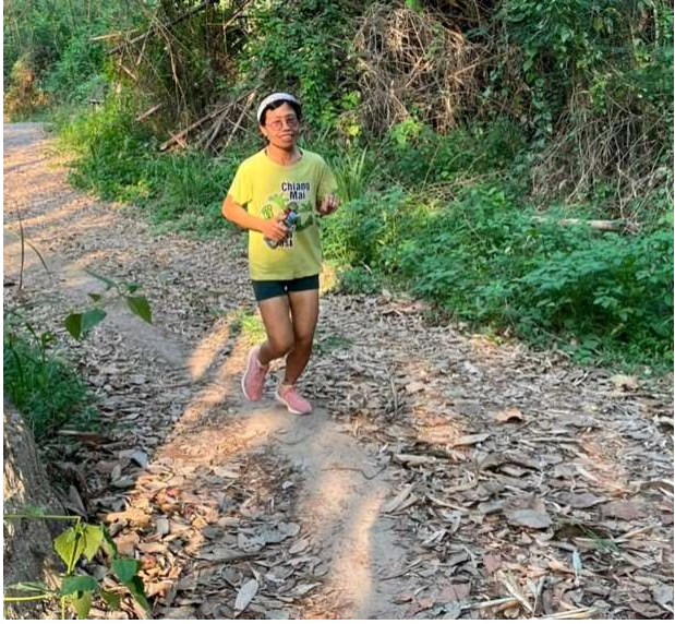
Periodical on trail