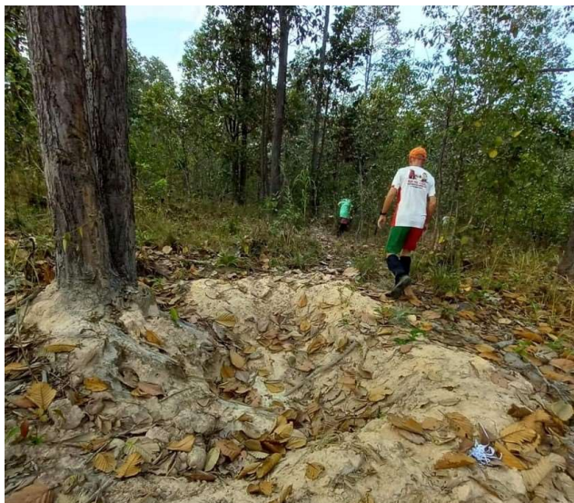
Pig Shit and Graven Image following paper through the bush