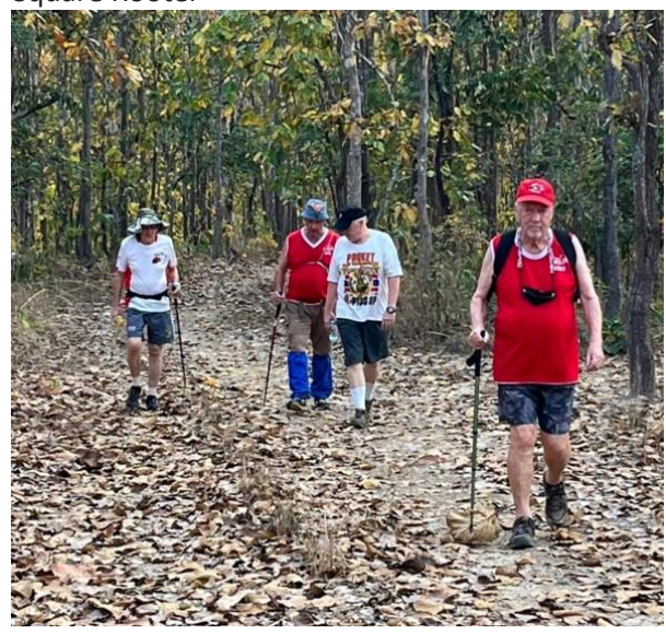
Sups leads the walkers -- Head Hacker, Tip Toe and Square Rooter