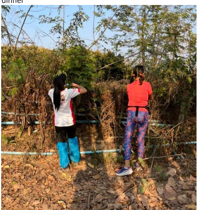
Always on Top and Bushy Tail foraging for tonight's dinner