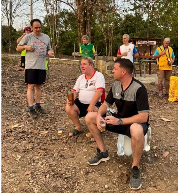
Hares Deep Throat and Stumbling Dyke on ice