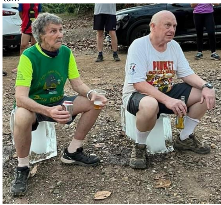
Square Rooter (welcome back!) and Head Hacker take a turn