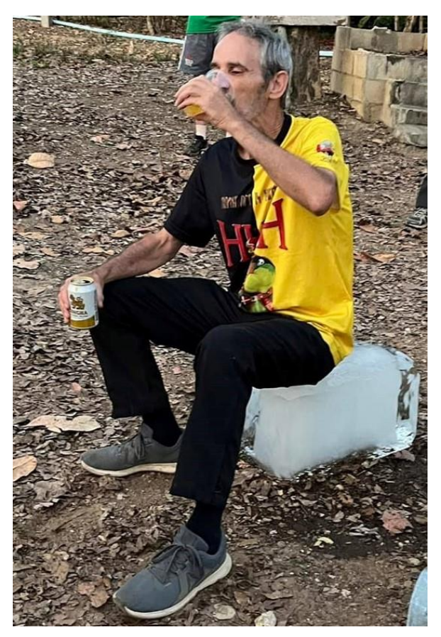
Devil's Reject - fell in a ditch - and is iced for it