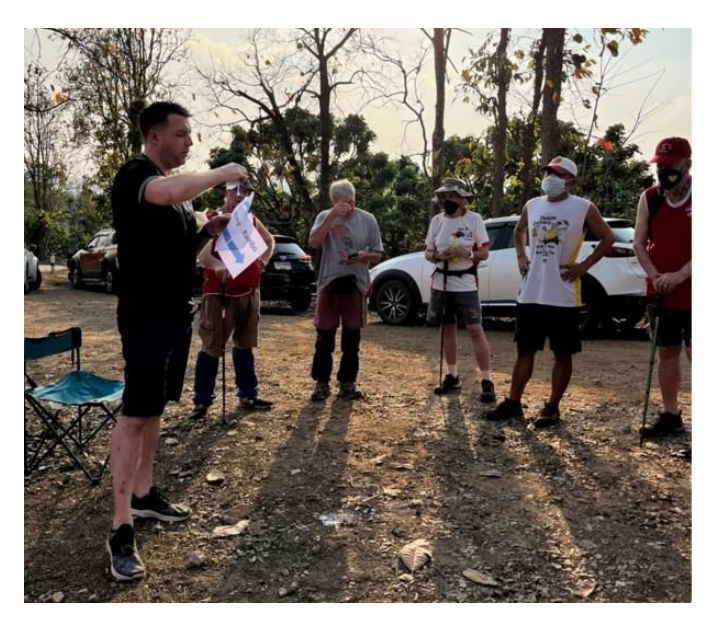
Deep Throat gives the hare brief