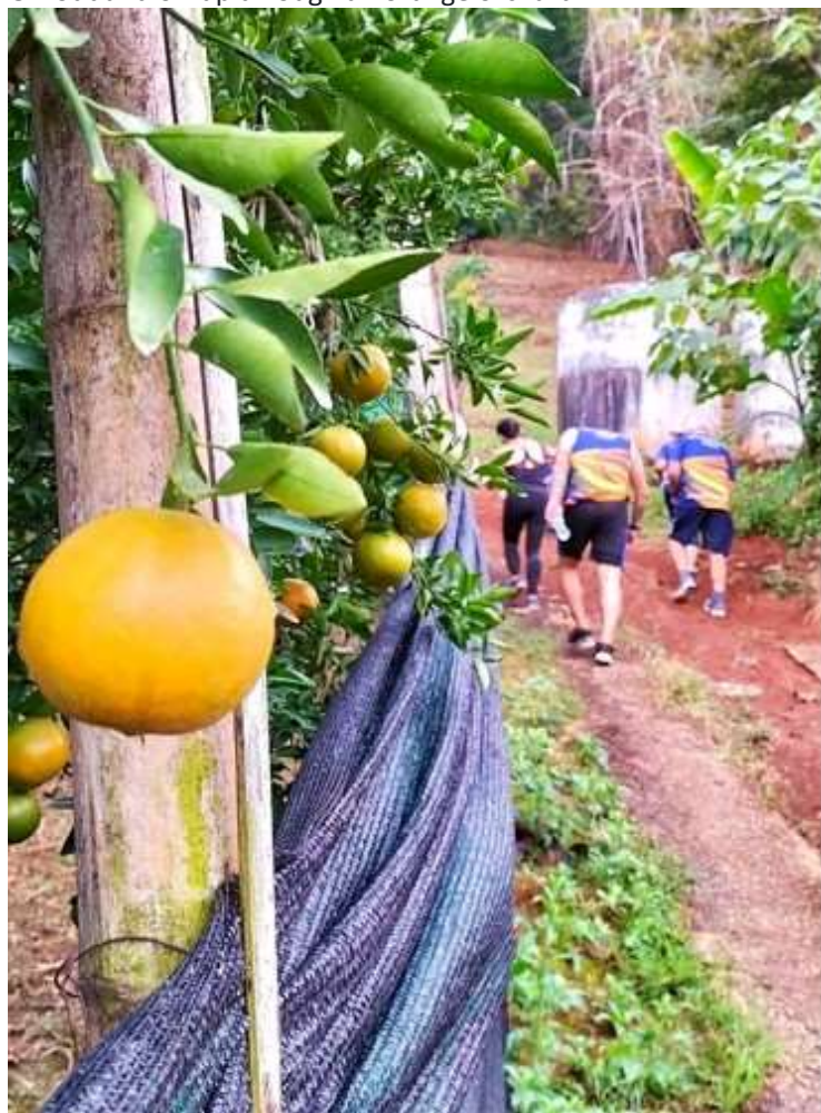
On-out and on-up through an orange orchard.