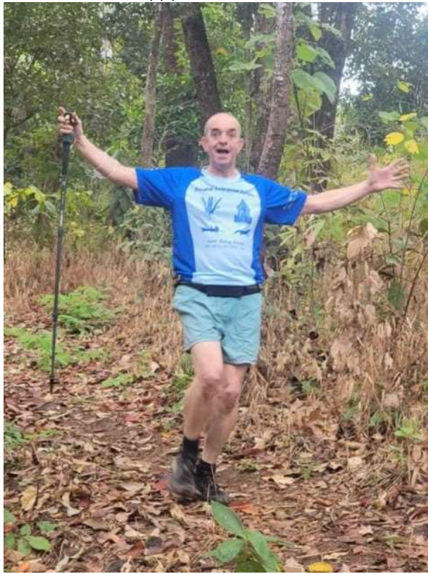
BKK visitor 4x2, happy to make it back.