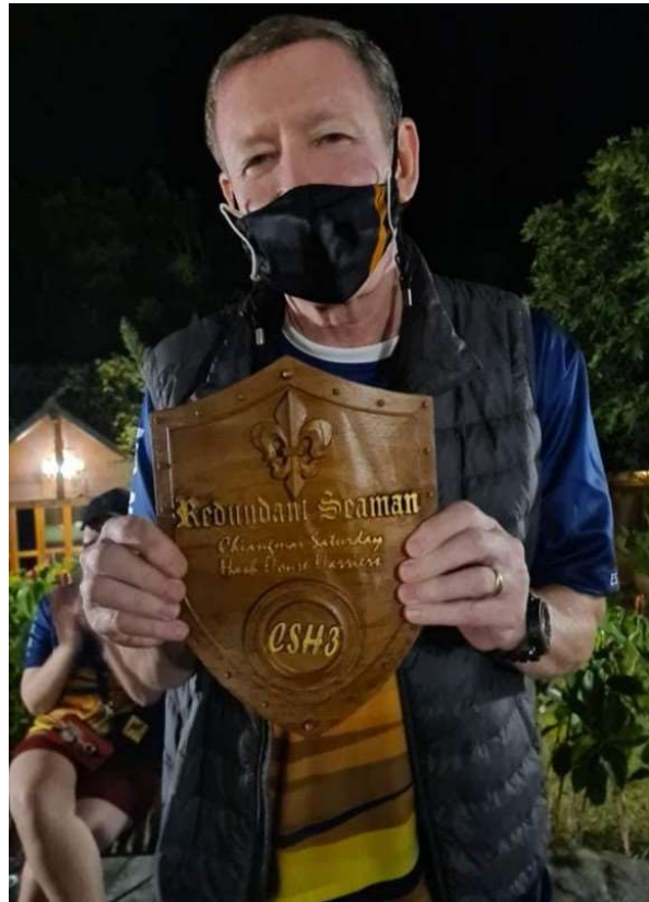
Hare Redundant Seaman. Thanks!