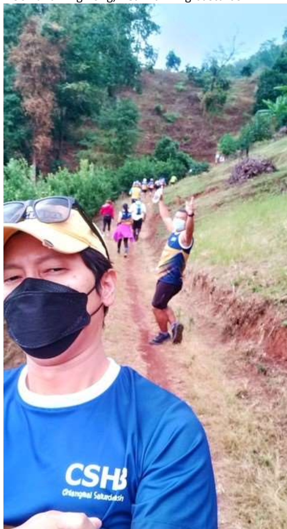
Hook and Ting Tong, Rear-running bastards