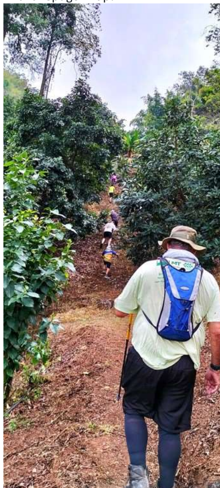
And it kept goin' up!