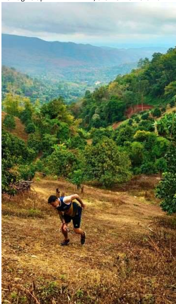
Don't give up M*****f****r, the view is worth it