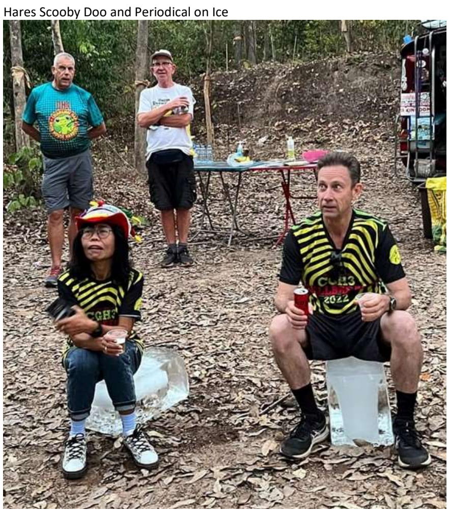
Smokey welcomes back Mary Poppins and family