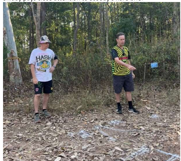
The Devil's Reject in the bush

Skiddy pays close attention to Scooby's hare brief