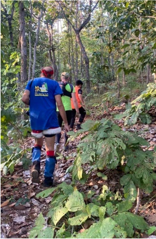
Sno-balls, Sheepy and Sticky Balls, going up the Wimp hill