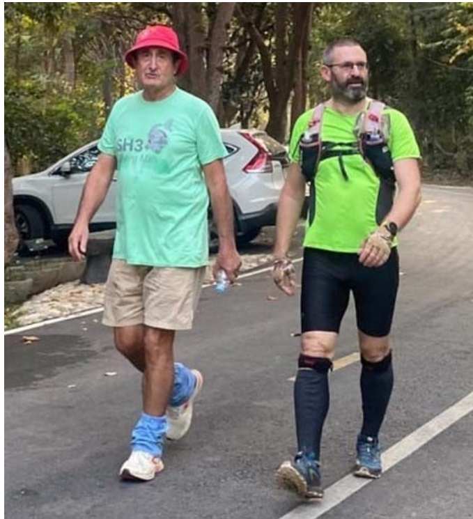
Turkish Delight and Sheep Shagger doing their own thing.