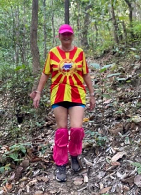
Discharge coming down the hill..