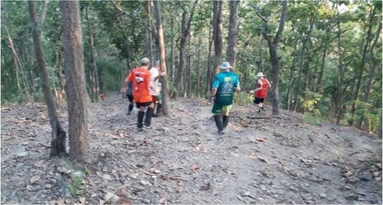
The steep slope and the backsides of Strangely Anal and Prison Bitch.