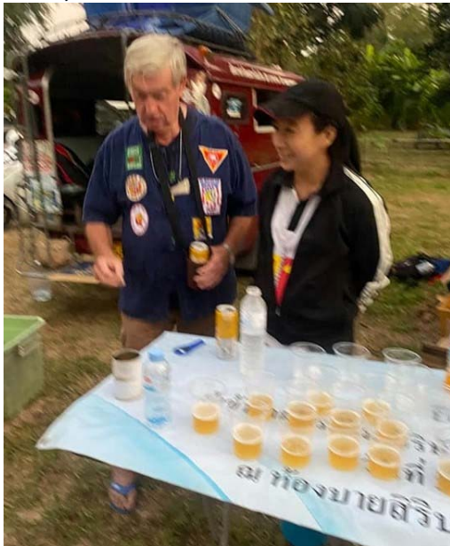
Hash Splash Always on Top getting splashes ready, and Tip Toe recycles the can-tab.