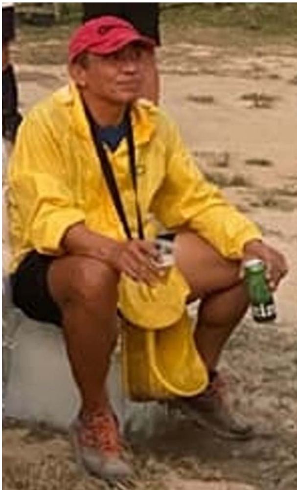
We think Hash Shit for the hare