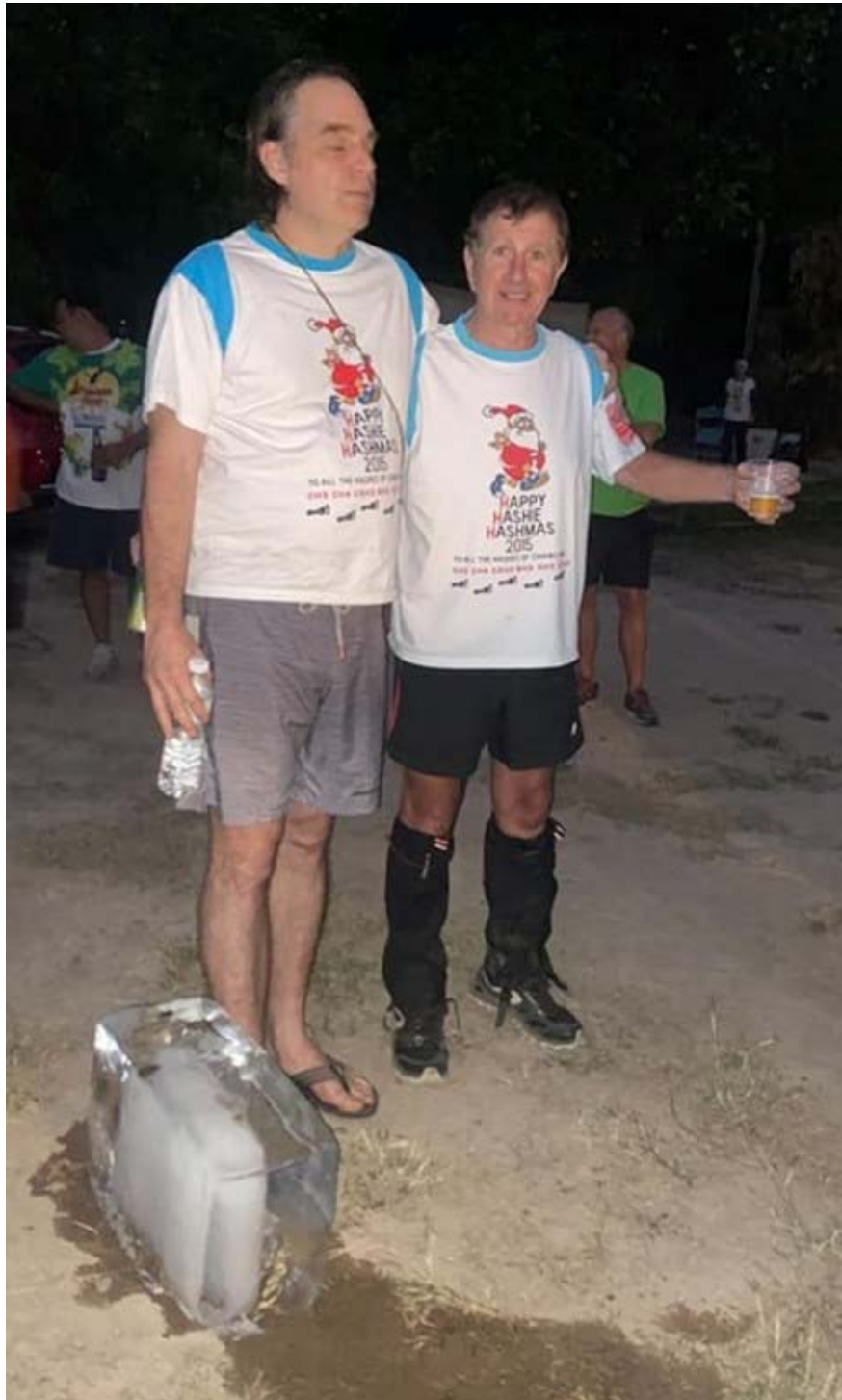
Merry Christmas and Happy New Year!