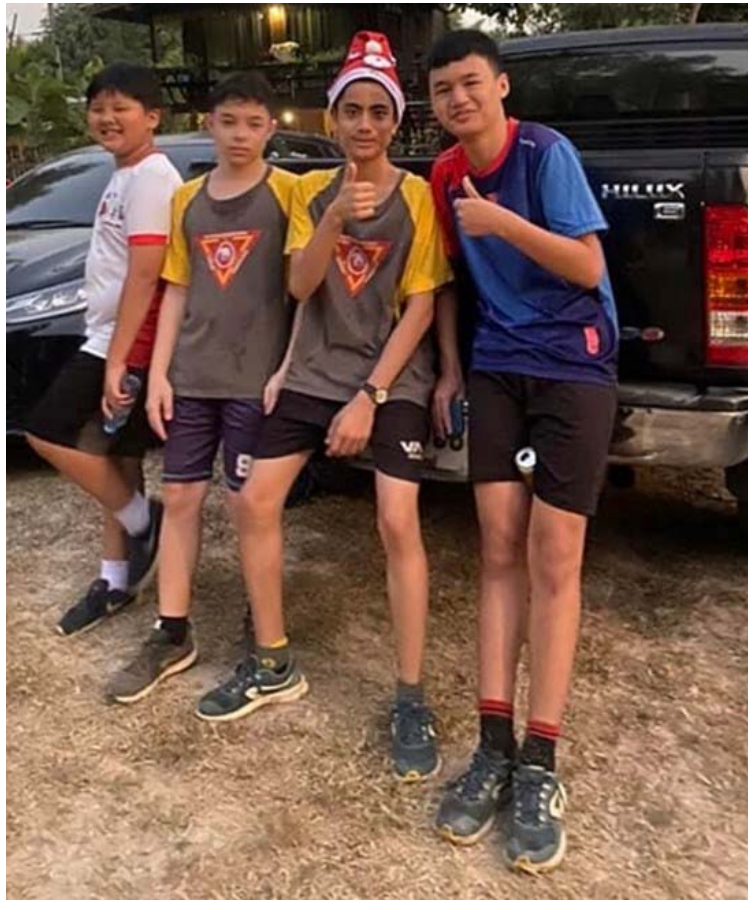
Pre-circle: Boys will be boys.