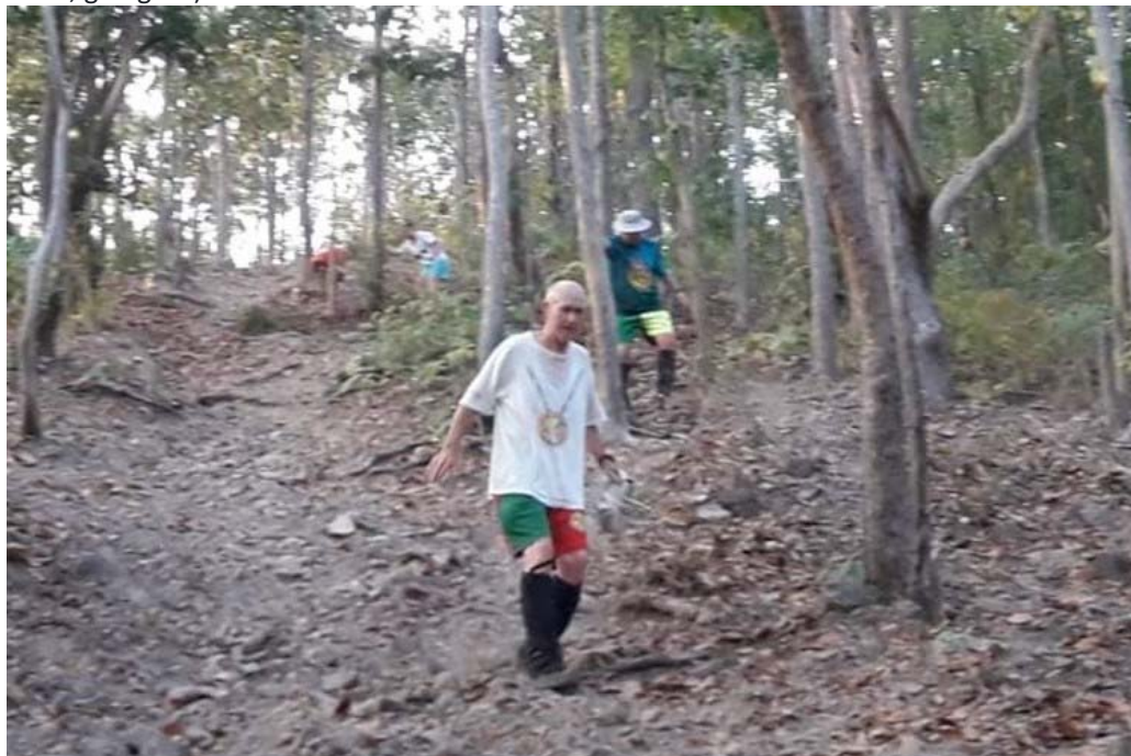
Graven Image, racing...