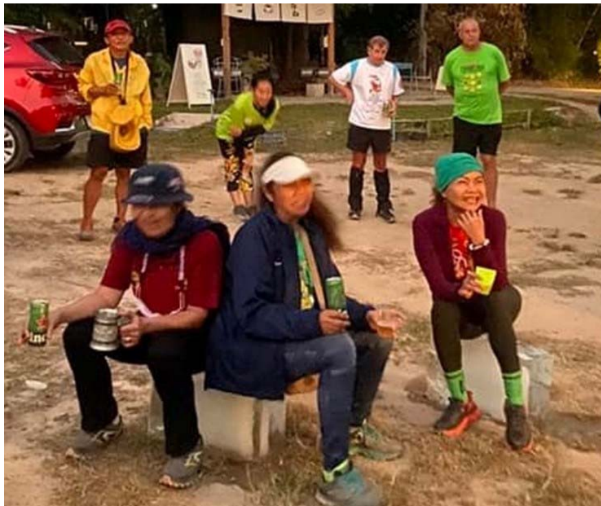
Superbitch and Boiled Egg on the ice. Long-time-no-see Geisha!