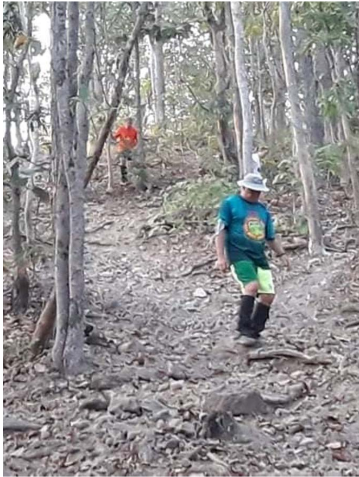
Another view of that slope and another view of Strangely and PB (their backsides look better than their front sides, go figure)