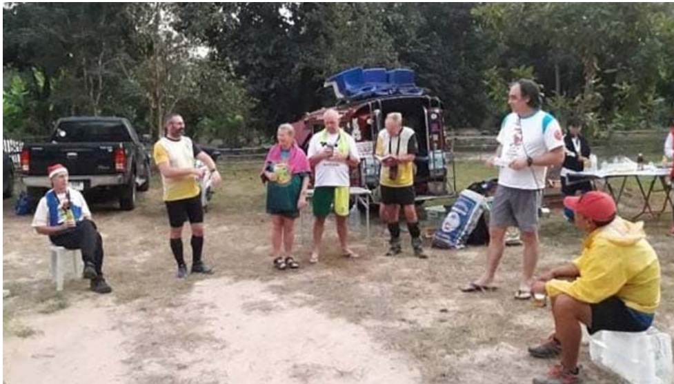
Hash Circle: what did we think about the run?